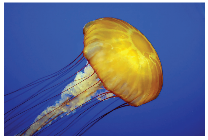
Pacific sea nettle, Monterey Bay Aquarium, Monterey, California

While we will only be studying humans in this course, every life-form has specific anatomy and physiology that has adapted over millions of years to function optimally in its environment. Why are there "simple" life-forms, such as jellyfish or moss, and more complex lifeforms, such as bears, humans, and giant oak trees? Why doesn't everything evolve toward complexity? We could answer that with a simple question: why should they? If the structure allows the organism to function perfectly in its environment, there is no reason to evolve. For this reason, we have the incredible diversity of life that exists on our amazing planet.