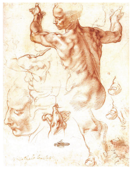
Michelangelo sketched hundreds of poses as he studied the intricate anatomical form and motion of the human body.

The human body is an incredibly complex machine. It can be amazing, confusing, mysterious, and wondrous all at the same